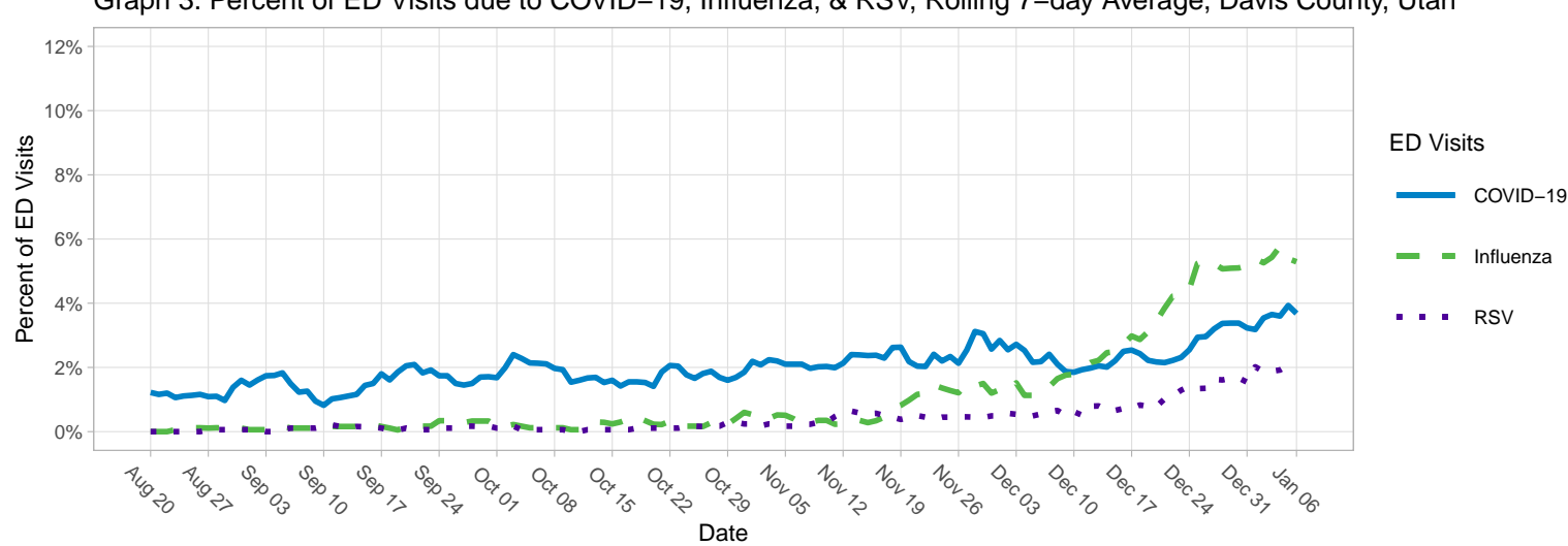
Graph 3. Percent of ED Visits due to COVID-19, Influenza, & RSV, Rolling 7-day Average, Davis County, Utah

Graph 3 displays the rolling 7 day average of the percent of emergency department (ED) visits due to COVID-19, influenza, and respiratory syncytial virus (RSV). These data are obtained from syndromic surveillance and only consider the diagnosis discharge codes for each condition. Table 1 presents two data points for each virus: the current trend of ED visits (increasing, decreasing, or no change), and the percent of ED visits due to each during the currently reported week.