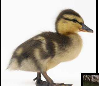
Left: This duckling is fuzzy and still needs its mother.

Myth : A duckling can <u>not</u> survive on its own without its mother's warmth and protection from predators. Ducklings without a mother will perish.