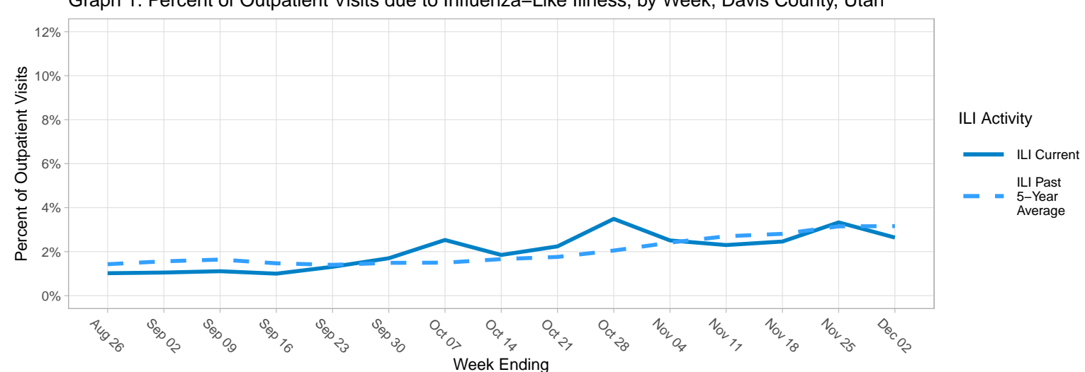
Graph 1. Percent of Outpatient Visits due to Influenza-Like Illness, by Week, Davis County, Utah

Graph 1 displays the weekly percentage of outpatient visits due to influenza-like illness (ILI). For comparison, the dashed line shows the previous 5-year average (2018-2022) of ILI activity. This week's ILI rate was 2.6%.